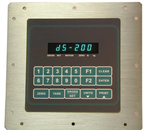
Stainless Steel DS200 Panel Mount