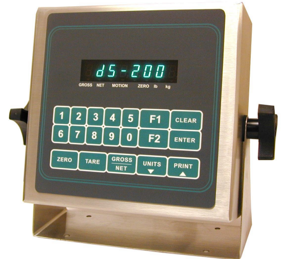
Stainless Steel DS200 Wall Mount