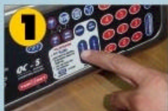
Press SAMPLE key

Only read the visual guide on the keyboard for quick operation