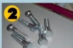
Put a piece sample on the plate