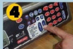
Press ENTER key, the scale will calculate an average weight of each sample piece. Save weight at the memory key and when you have to count the same piece, only remember the memory in which you save it.