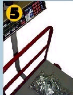
Press ENTER, automatically scale will count the pieces over the plate. If you require to count several closed packages, the scale features addition function, pressing this function will keep the sample and when you are done you will get a total.