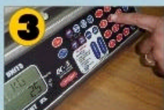
Type number of sample pieces