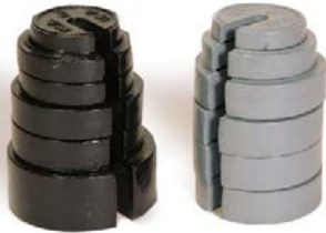
< Counterpoise Weights